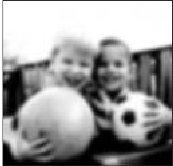
The same scene as viewed by a person with cataract